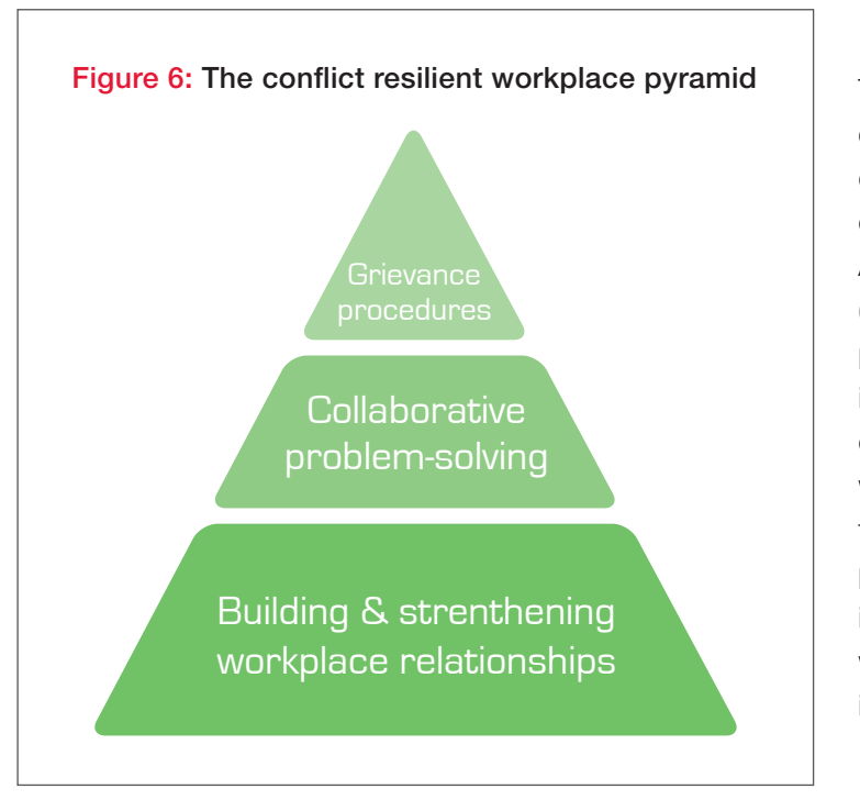
Figure 6 depicts a conflict resilient workplace. Appendix C describes the attributes of a workplace with reference to the three layers of the 'conflict resilient workplace pyramid'.

This diagram reflects an environment that is no longer dominated by a heavy reliance on grievance procedures. At the top of the pyramid (grievance procedures) formal processes are employed only in respect of allegations of criminal or serious misbehavior; where there is a lack of good faith; situations where public policy, procedural or legal issues arise, or where the welfare of individuals is threatened.