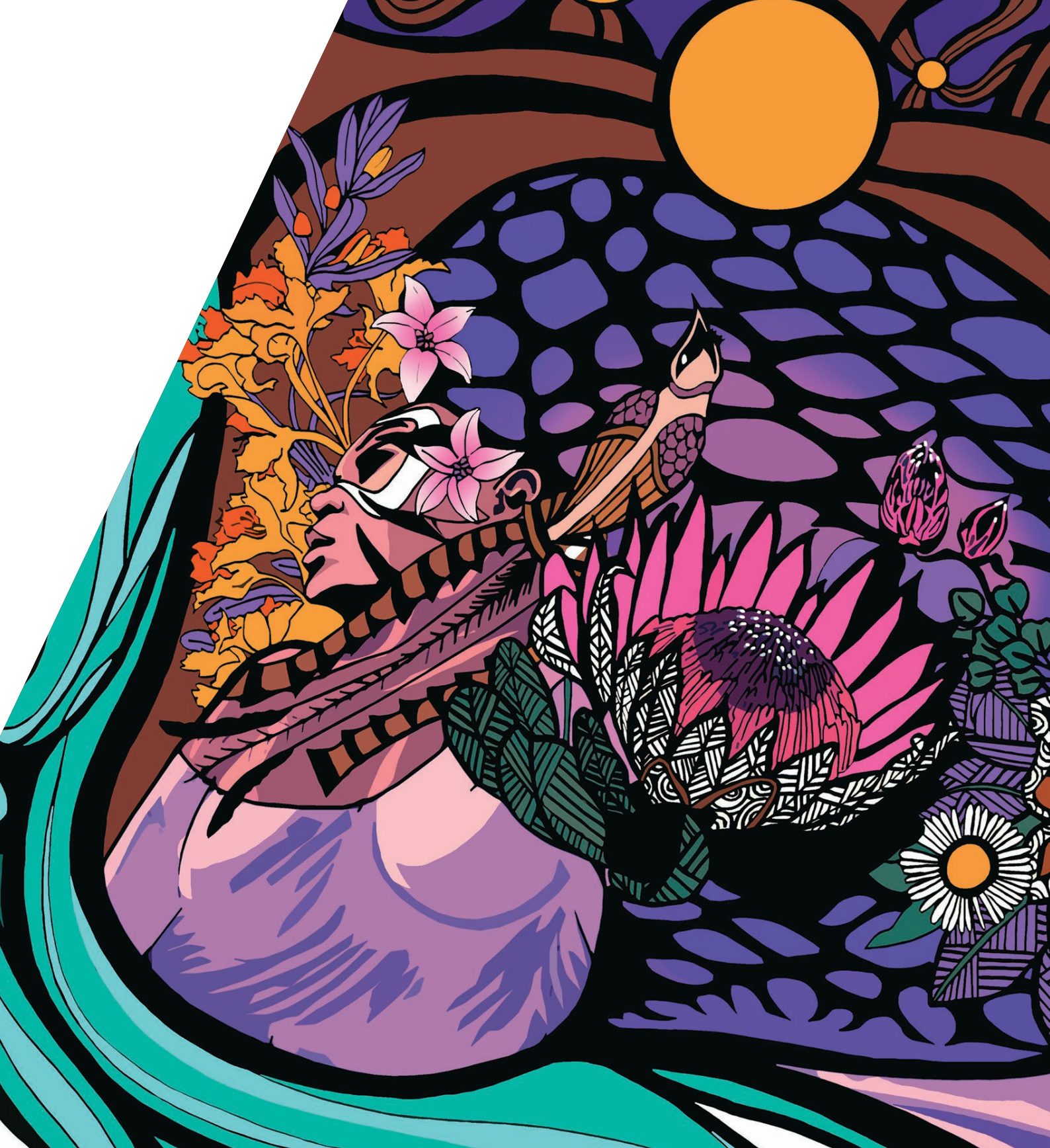
Artwork: Collaborative Motivation to Employ by Jade Kennedy