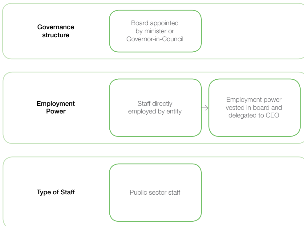
Figure 4: Standard model for public entity employment arrangements

Figure 4 outlines the standard model for public entity employment arrangements in Victoria.